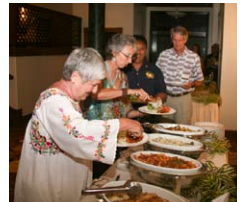
Many more friends and Rotarians not pictured were at the party.