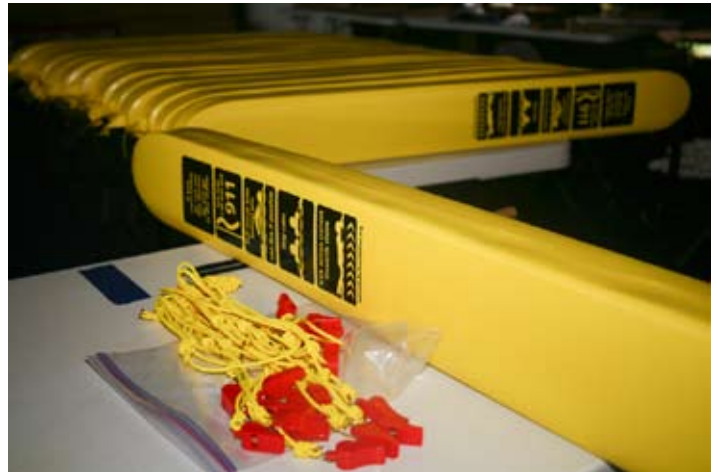
Rescue tube inventory ready to be assembled and shipped. Another work day coming up.