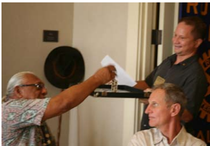
Kopa Kaluahine wins the weeks pot in a repeat performance.