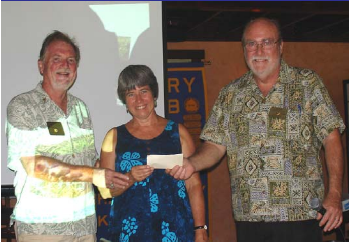
Presenting our check for $500 for the Nursing Scholarship