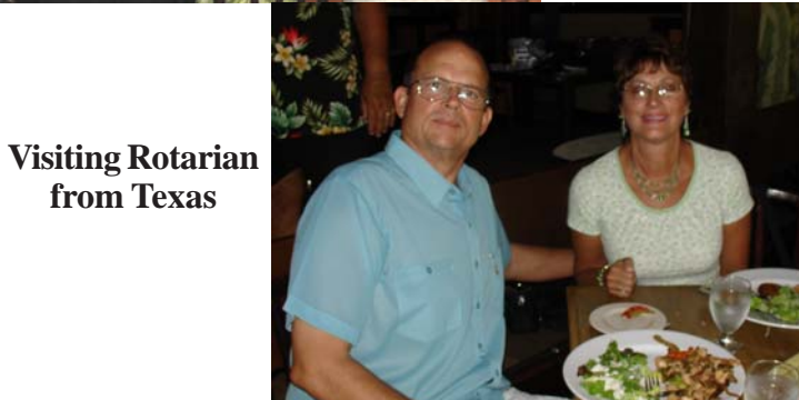
Visiting Rotarian from Texas