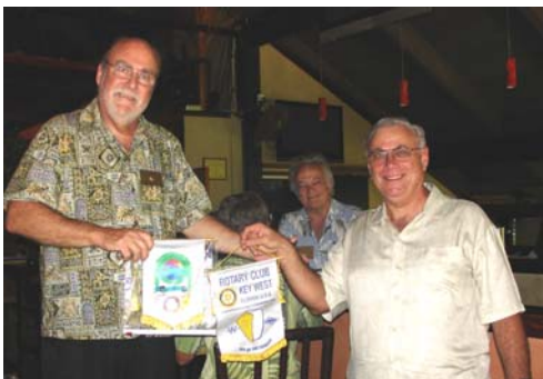
Banner Exchange with Key West, FL